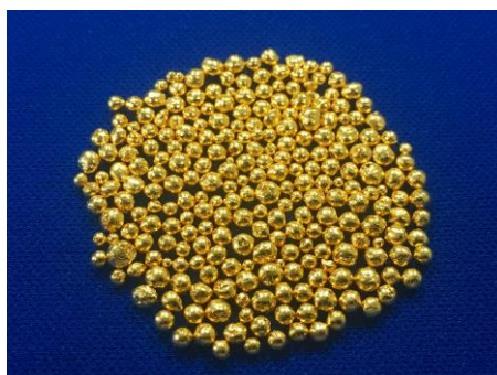
SJeva high-quality Au deposition material (granules)

As a result of the above properties and benefits of the new deposition material, it is expected to contribute to higher end-user productivity and lower costs when manufacturing final products that use deposition materials such as micro-wiring and MEMS in the semiconductor fields as well as optical devices, LEDs, and medical equipment.