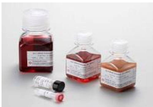
Nano-colloidal gold used in the kit

The existing method used for detecting ZIKV in blood is PCR*6, which requires special equipment and takes between half a day and one day to complete. With the new kit, however, the test strip only needs to be dipped into the test sample to enable ZIKV detection. Additionally, it allows detection in 10 to 15 minutes, equaling the simplicity and speed of the influenza virus detection kit already in practical application. Furthermore, unlike PCR, it does not require special equipment, thus realizing cost savings for users.