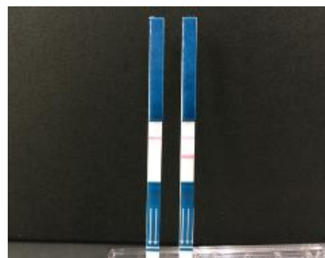
Demonstration of testing

(On the left is a negative and on the right a positive reaction. When the virus is detected, two lines appear.)