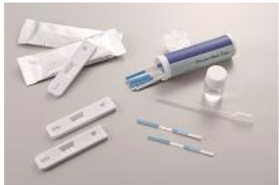
Examples of processing into test kits