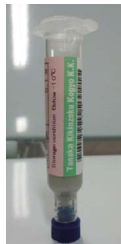
Appearance of Ag adhesive paste products

and recycling; 2) thanks to its low elastic modulus, high reliability is guaranteed; and 3) paste that meets each individual customer's requirements can be supplied through the company's well-thought-out technical services in which development, manufacturing, and sales are integrated.